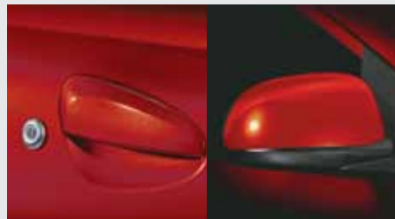
Body Color Door Handles & Mirrors