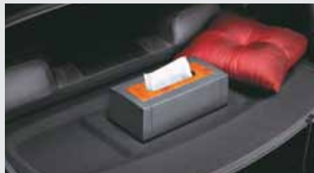
Rear Parcel Tray