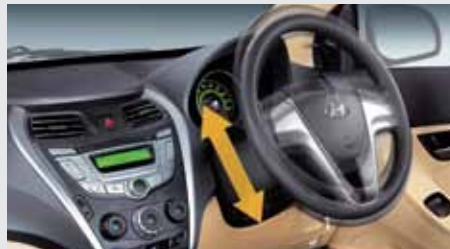
MDPS with Tilt Steering