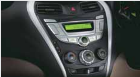
AC & 2 DIN Audio with Aux-in & USB Ports

When it comes to comfort or convenience, the Hyundai EON boasts of both in equal measure. It contains all the features you'll ever need, well designed and placed within easy reach.