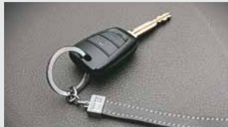
Keyless Entry & Central Locking