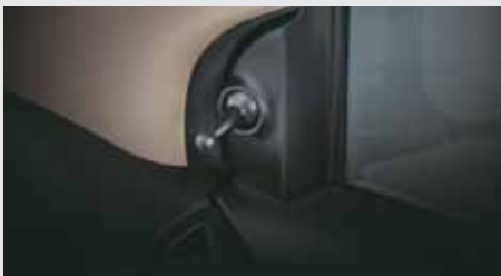
Internally Adjustable Outside Mirrors