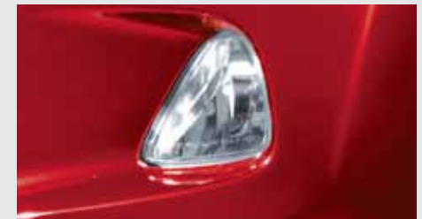
Front Fog Lamps