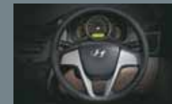
3-Spoke Steering Wheel